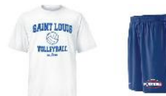
ILLEGAL These are NOT Track & Field uniforms.