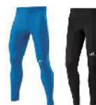
LEGAL Uniform Bottoms with single manufacturer logo, NO decorative waistband or crotch outline

NOTE: The ultimate responsibility to have each competitor compliant with jewelry and uniform rules is with the coach. Coaches should inspect any/all garments that competitors wear to ENSURE that they are in compliance with the GHS & NFHS Jewelry and Uniform Rules!!