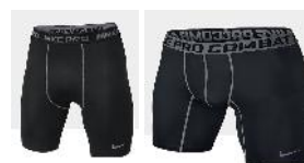
ILLEGAL Uniform Bottoms with decorative waistbands and crotch outline / opening