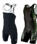
ILLEGAL One-piece Uniforms with multiple manufacturer logos / references.