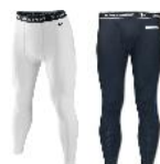
ILLEGAL Uniform Bottoms with decorative waistbands, multiple manufacturer logos, crotch outline