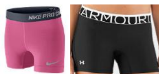
ILLEGAL Uniform Bottoms with decorative waistbands and multiple manufacturer logos / references.