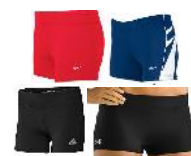
LEGAL "Closed-Leg" Women's Brief Uniform Bottoms