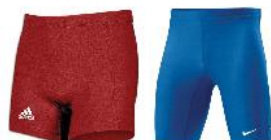
LEGAL Uniform Bottoms single manufacturer logo, no crotch outline or opening, no decorative waistband.